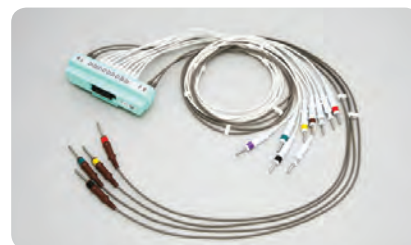
for ECG-1550, 15-lead ECG